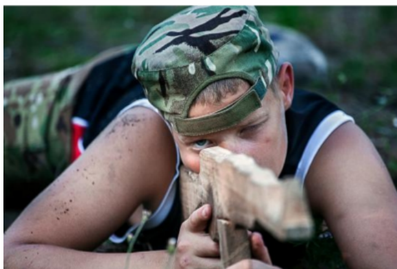
A boy practises with a wooden replica rifle in a field 20 miles west of Ukraine's capital, Kiev

Azov insist these aren't child soldiers. "We don't train children for frontline activities here," says one leader. "The objective is to raise their awareness about the war." At dusk, the sound of prayer rings through the compound. "Burn all weakness from my heart," recite the cadets, "so I will not feel fear or doubt. Make my spirit strong."