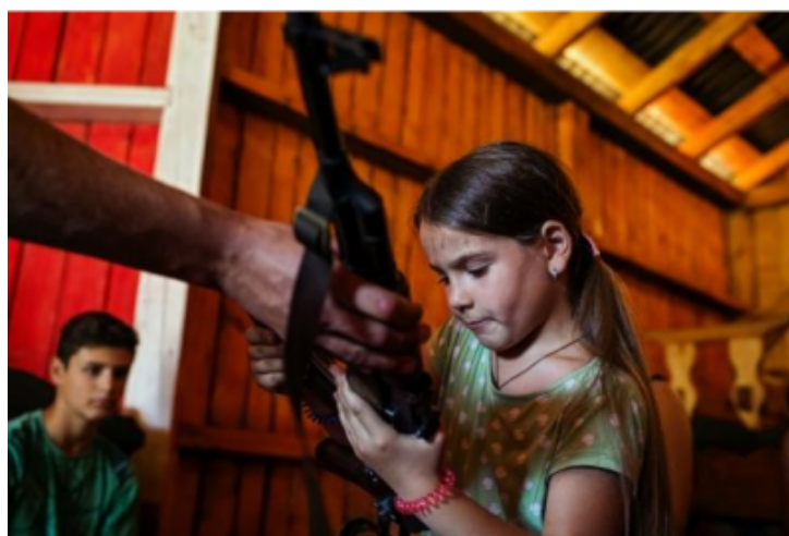
Gently does it — a young girl learns how to handle, clean and maintain an AK-47 assault rifle