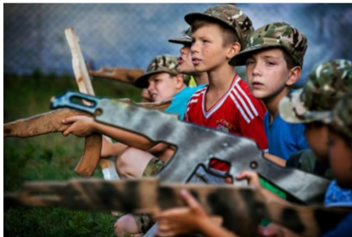
The wooden guns appear almost toylike, but war games form part of the children's tactical training