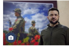
On the Day of the National Guard of Ukraine, President Volodymyr Zelenskyy awarded NGU servicemen

Kyiv region, Sumy region, Chernihiv region, the south of our state - the army stopped the occupiers. The initial plan of the Russian military to seize our state failed. And it seems that they do not know what else can be done to us. It seems that their military commanders are not able to offer their political leadership anything but cruel and erroneous tactics to exhaust us, to exhaust Ukraine. Nothing but constant strikes at the civilian population, peaceful cities, people, children, missiles, air bombs, shelling from "Grads", "Uragans". Nothing but the destruction of non-military infrastructure - residential buildings, hospitals, schools, churches.